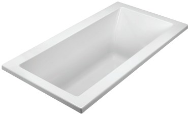
Shown with Whirlpool Package